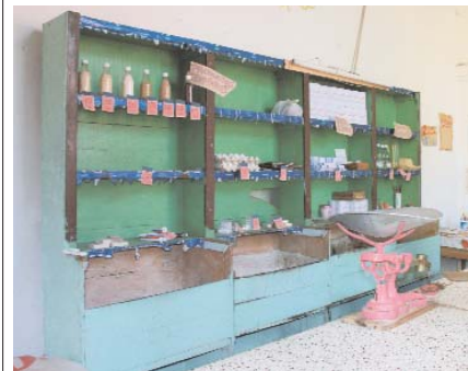
Ration shops for food and basic provisions are found all over Cuba. All Cubans receive the same amount, irrespective of how much they earn

No one is sure if Castro's legacy will persist, or whether relations with the US will improve and Cuba's economy be revived. Perhaps Cubans will soon have Sky TV, new cars to replace the clapped-out Cadillacs, and the freedom to enter the US. And perhaps they will be allowed to eat in a paladar – though I don't think it would be half as much fun without the sneaking around.