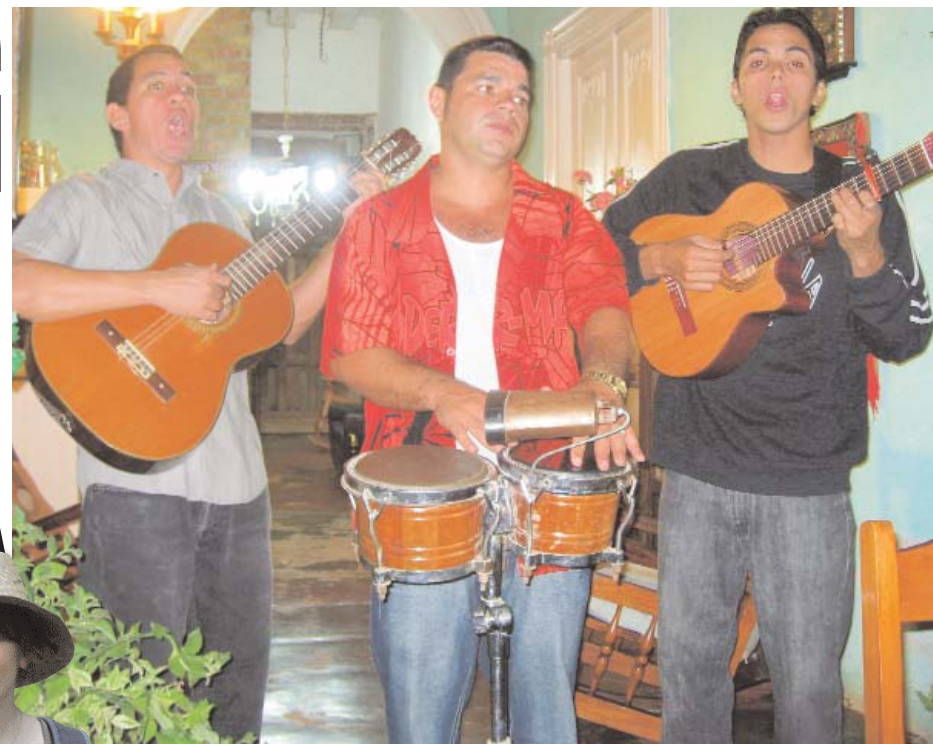
Our tour group was entertained in the paladar while we ate. The man who led us to his home for dinner is on percussion.