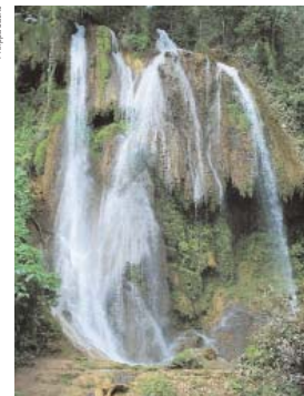
You can hike to waterfalls in Topes de Collantes