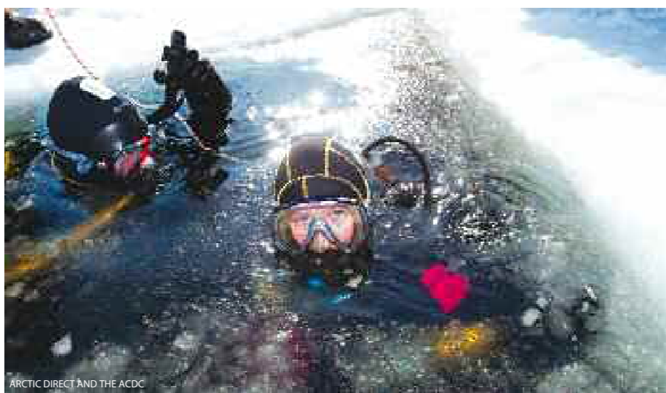
ARCTIC DIRECT AND THE ACDC

POLE POSITION: Taking ice-diving to a new