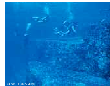
OCVB - YONAGUNI

MAN OR NATURE? Tour operator InsideJapan recommends the small sub-tropical island of Yonaguni, part of the Yaeyama chain, as an