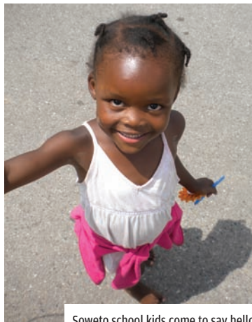
Soweto school kids come to say hello

Our group sets off in a slightly wobbly convoy, stopping every few minutes for NK to explain how Soweto (South West Township) was created under apartheid, and how its current population - estimated at up to two million people - now live.